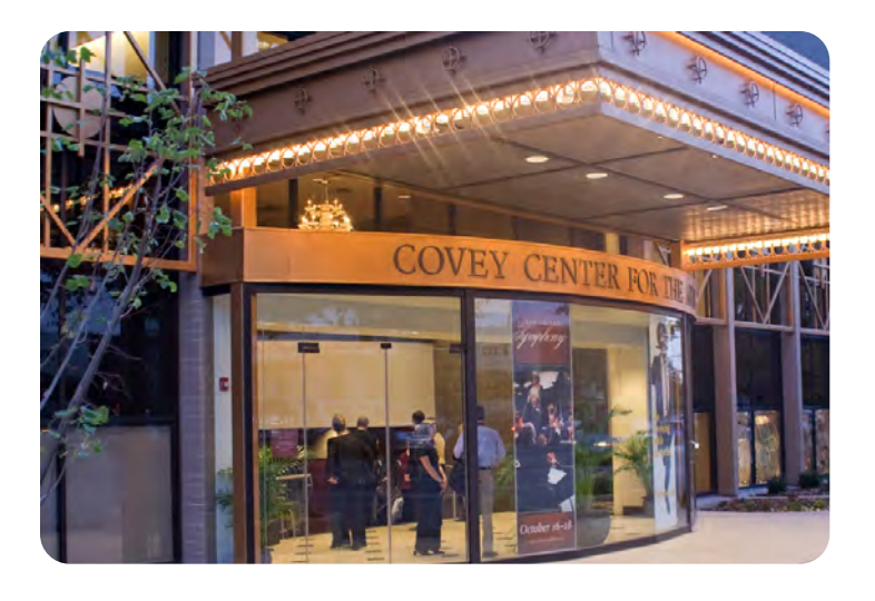
Goal 3.3 - Provide enhanced opportunities and facilities for the arts, entertainment, and museums reflecting Provo's status as the county seat of the second-most populated county in the state.

Objective 3.2.7 Build an equestrian trail on the south side of the Provo River from Geneva Road to Utah Lake.