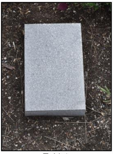
Tablet Page 5