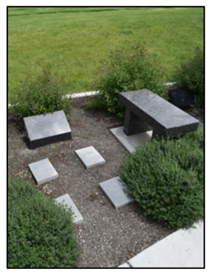
Bench Estates Page 17