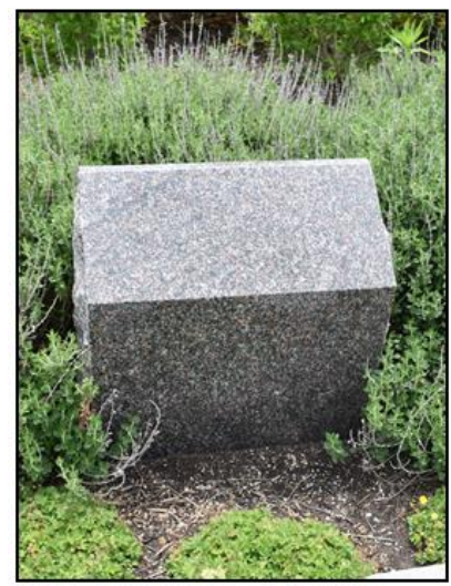
Cored Companion Page 12