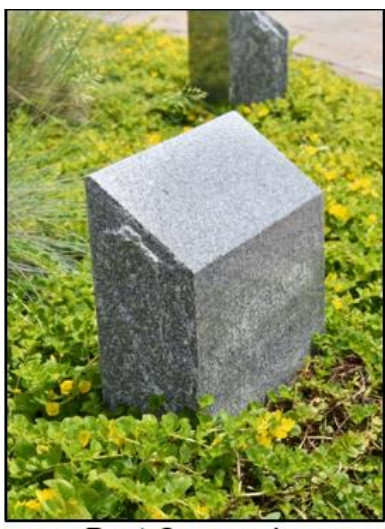
Post Companion Page 8