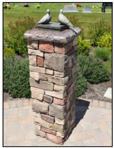
Ossuary/Cenotaph Page 4