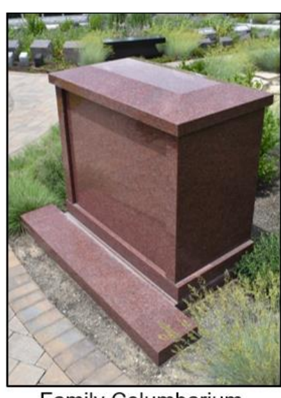
Family Columbarium Page 19