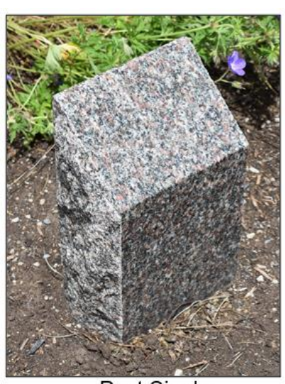
Post Single Page 6