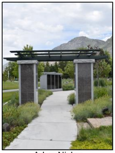
Arbor Niche Page 11