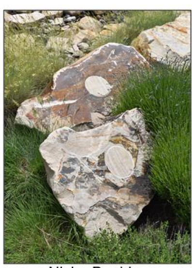
Niche Boulder Page 14