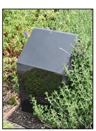
Cored Single Page 7