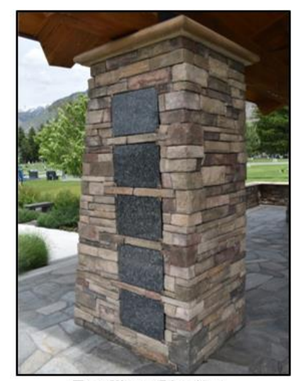
Pavilion Shutter Page 13