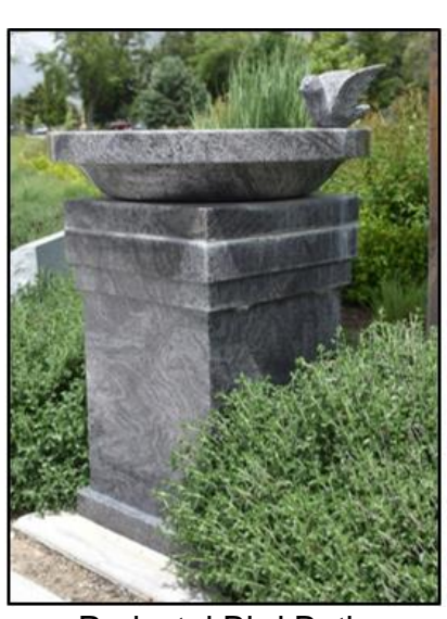
Pedestal Bird Bath