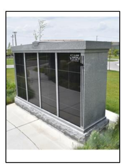
Community Columbarium Page 10