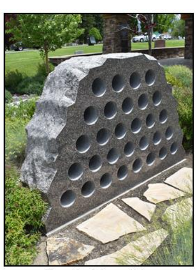
Rustic Monolith Page 9