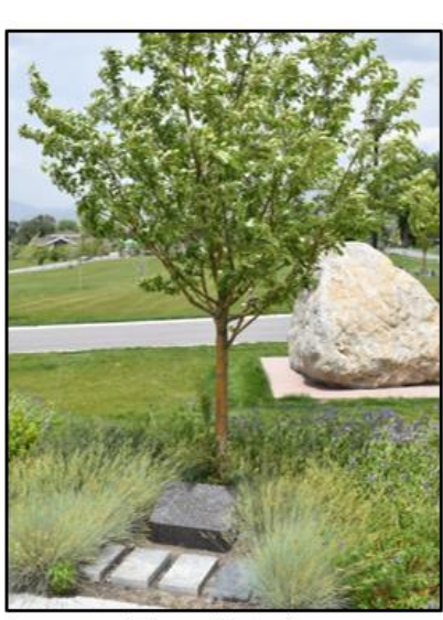
Tree Estate Page 15