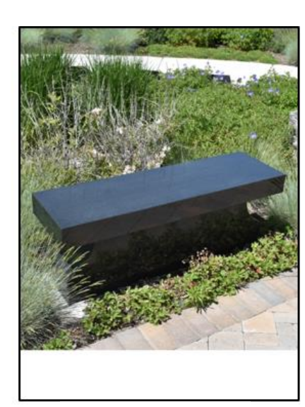
Bench Page 16