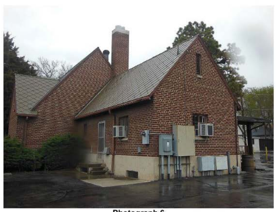
Photograph 6 South and west elevations of kitchen wing. Camera facing northeast.