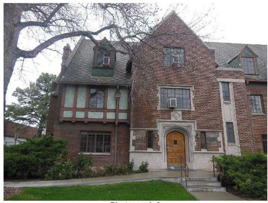
Photograph 3 East end of north elevation. Camera facing south.