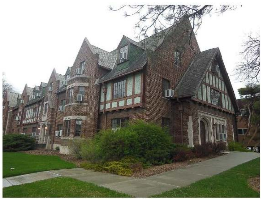
Photograph 1 North and west elevations. Camera facing southeast.