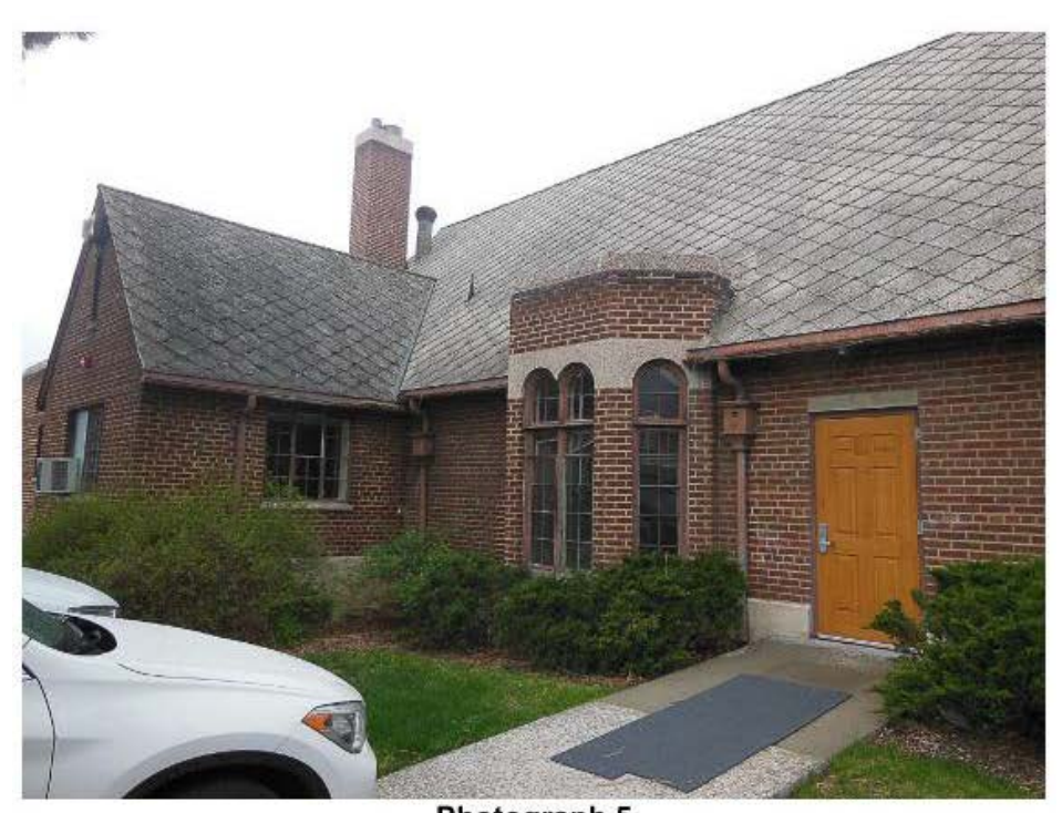
Photograph 5 East elevation of dining hall & kitchen wing. Camera facing southwest.