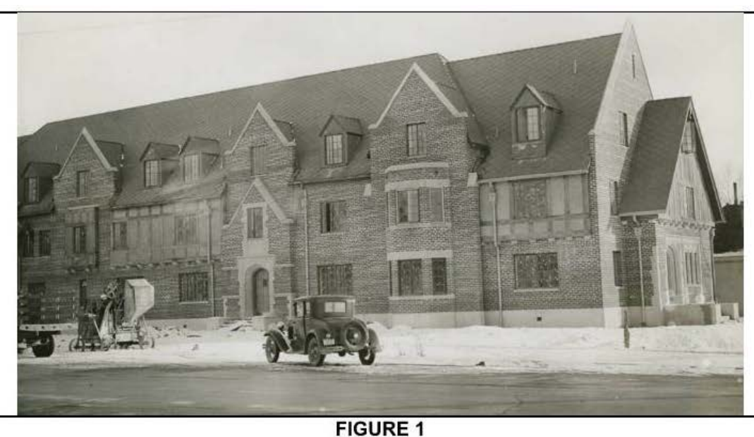
Amanda Knight Hall Provo, Utah County, Utah