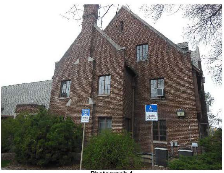
Photograph 4 North end of east elevation. Camera facing west.