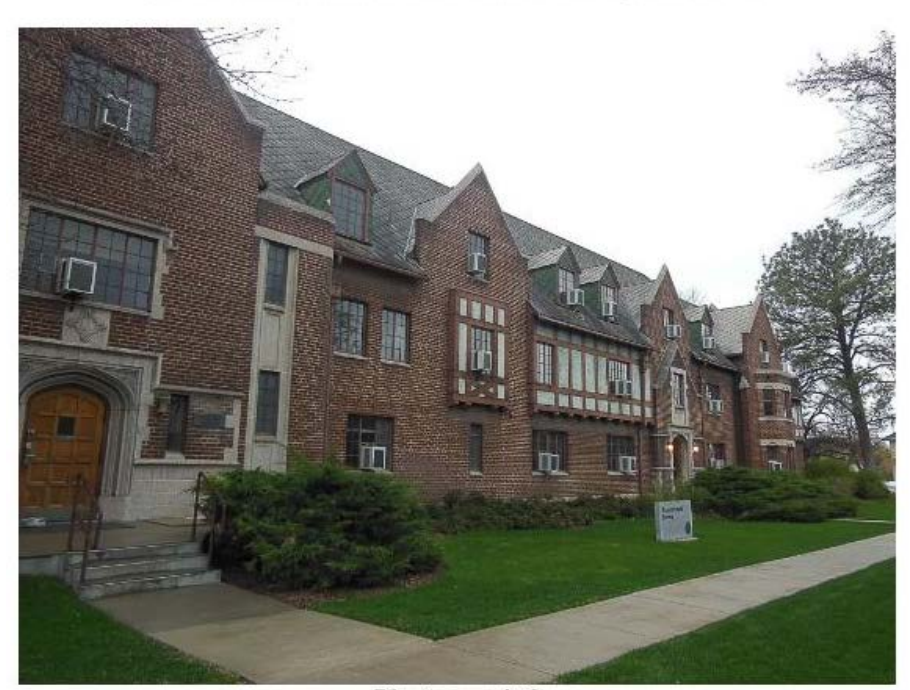
Photograph 2 North elevation. Camera facing southwest.