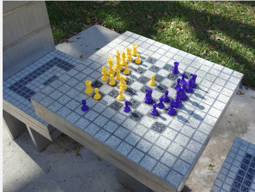
Not the actual table